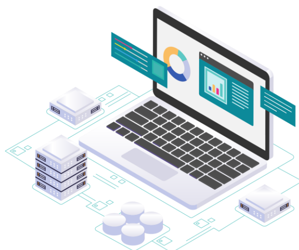
GIEAM ASSET MANAGEMENT SOFTWARE

GIEAM is a robust solution developed with an approach based on preventive maintenance and performance management . Developed from 30 years of experience in the industrial and energy sectors. It makes it possible to anticipate potential risks, reducing costs, guaranteeing the continuity and security of your operations and compliance with regulations and legal requirements.